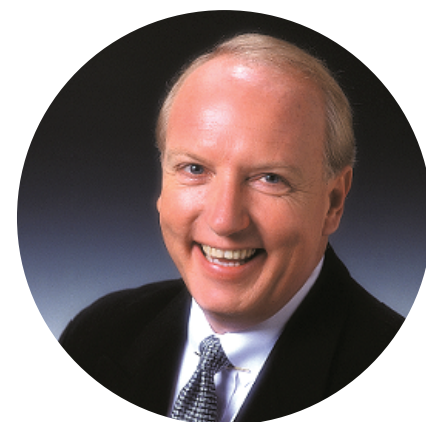
Mark Victor Hansen

“ If you want to be a great and inspiring speaker, you want to study with the best of the best. Brian Tracy is a superstar from the platform. He is the Man to study as he teaches you step-by-step how to go from nowhere to somewhere great in the speaking business. No one can do it better than Brian. ”